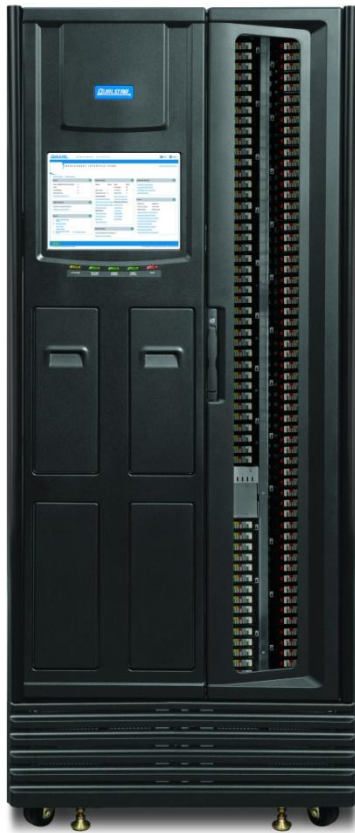
XLS Enterprise Library System